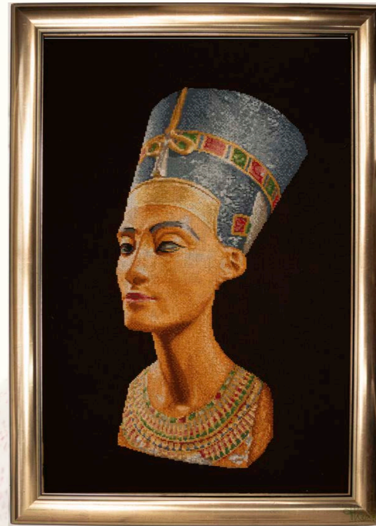
598.05 Nefertiti 35x55CM / 14x22 Inch