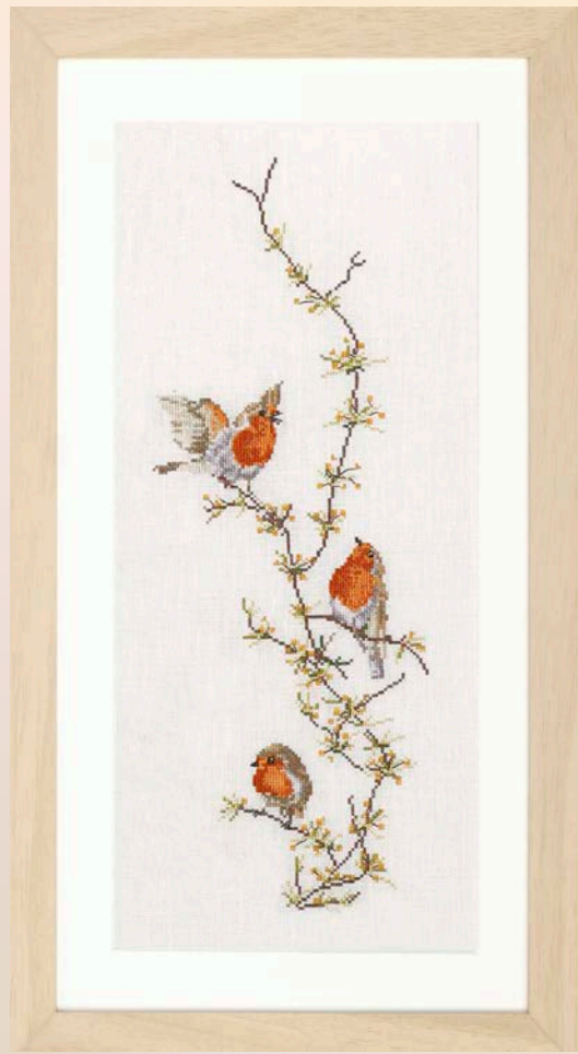
594 24x37CM / 9.5x14.5Inch