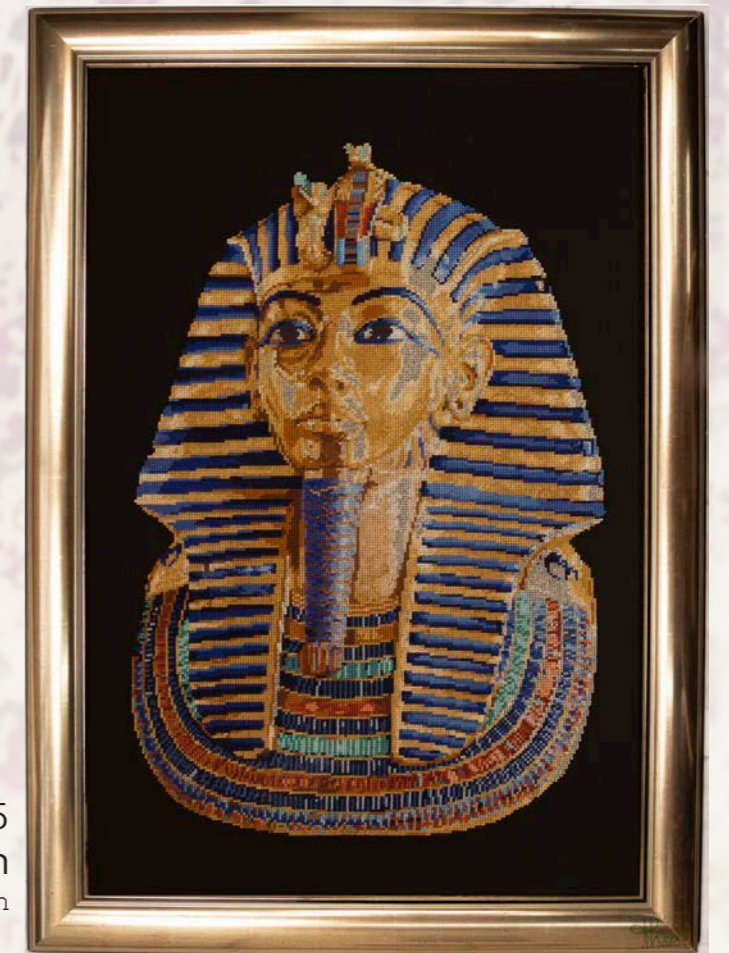
596.05 Tutankhamun 40x55CM / 17x23 Inch