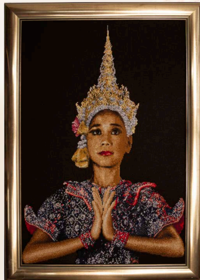
599.05 Thai Lady 40x55CM / 16x22 Inch