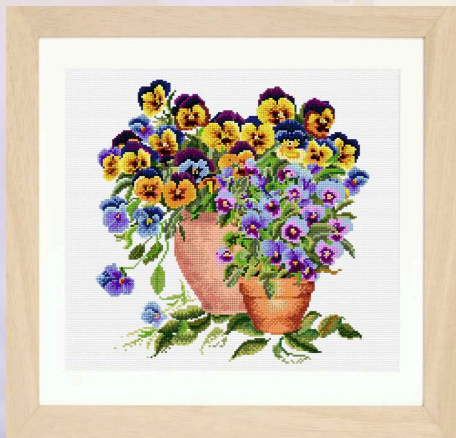
601 30x30CM / 12x12Inch