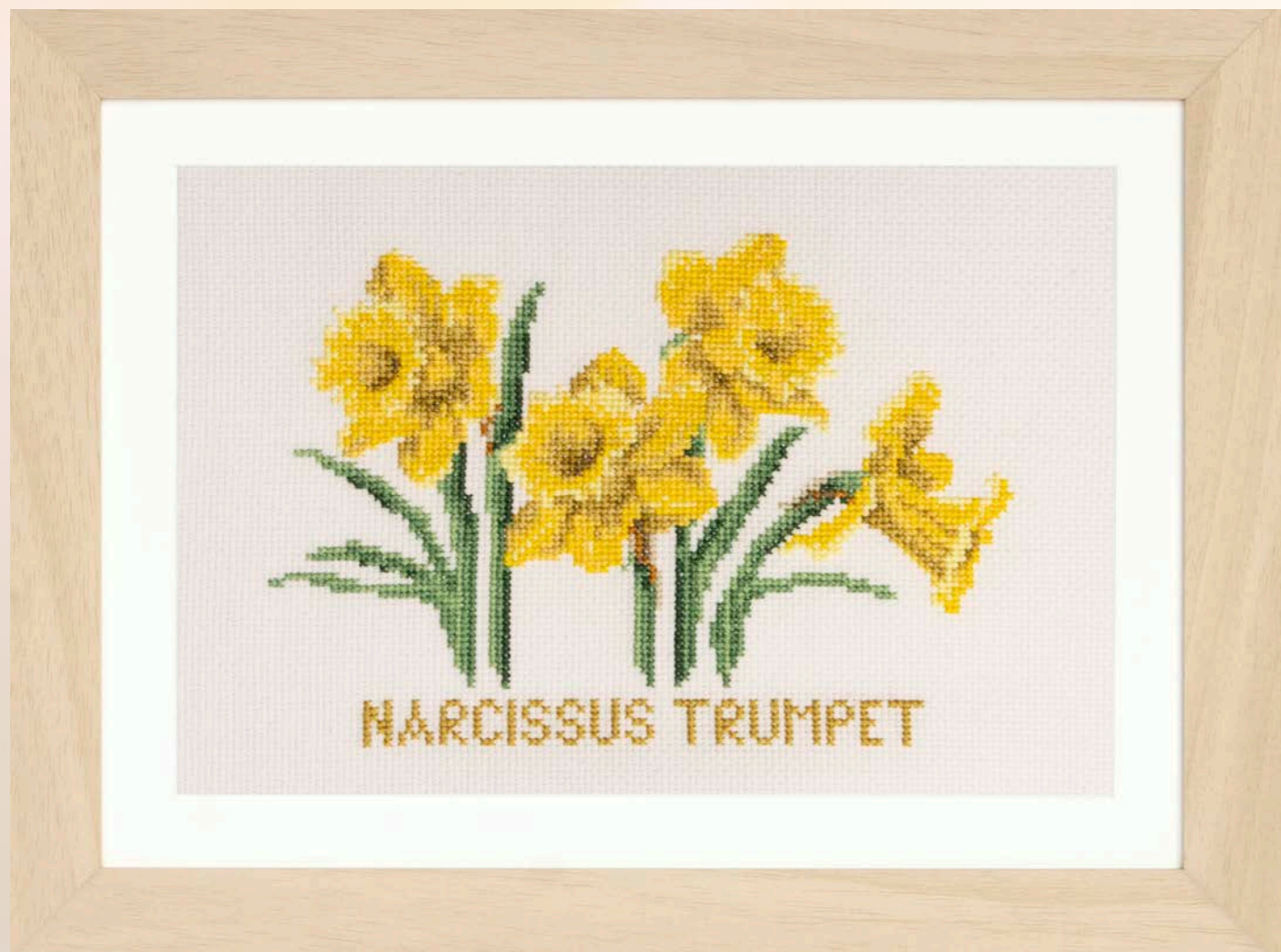
584 23x27CM / 9 x 10.5Inch