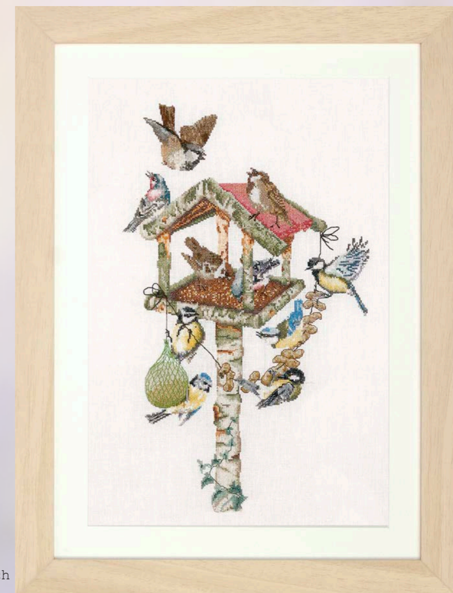
593 35x60CM / 14x23Inch