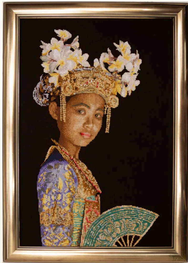
597.05 Balinese Dancer 40x55CM / 16x22 Inch