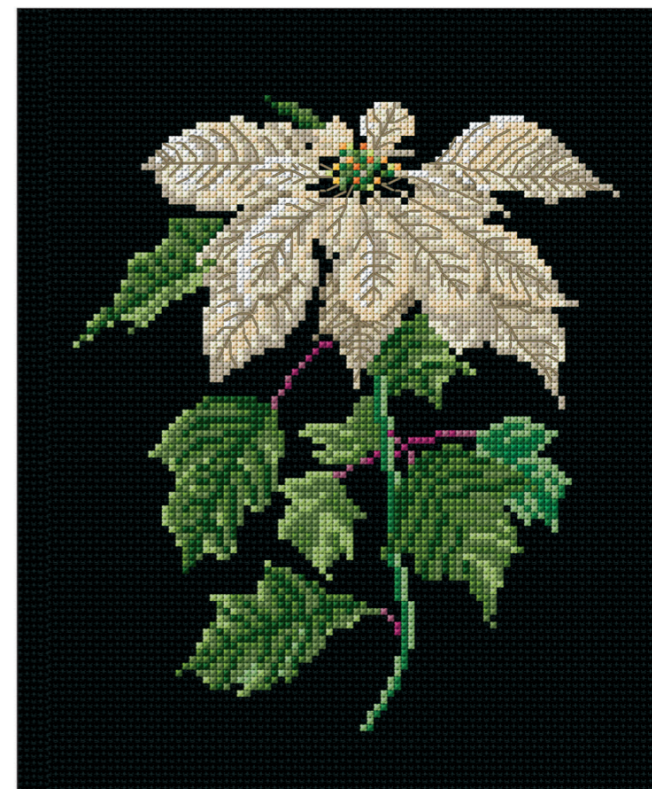
604.05 Poinsettia 18x30 CM / 7 x 12 INCH