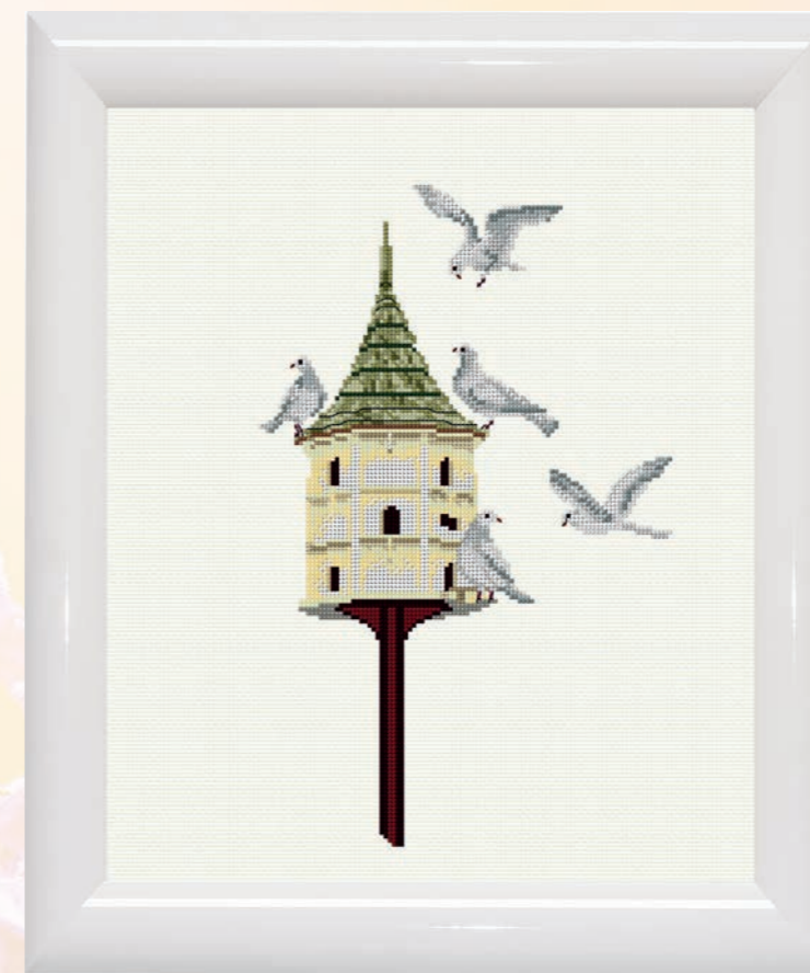
592 18x21CM / 7x8Inch