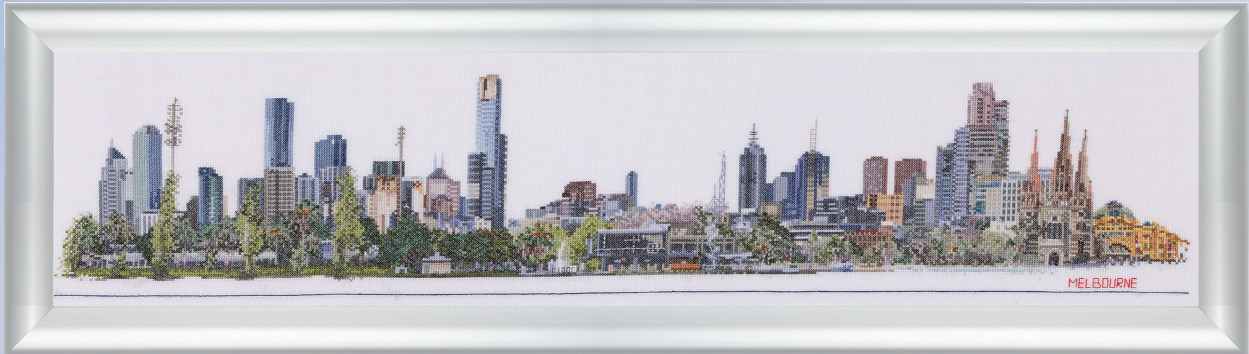
567 Melbourne 20x45CM / 8x18 Inch