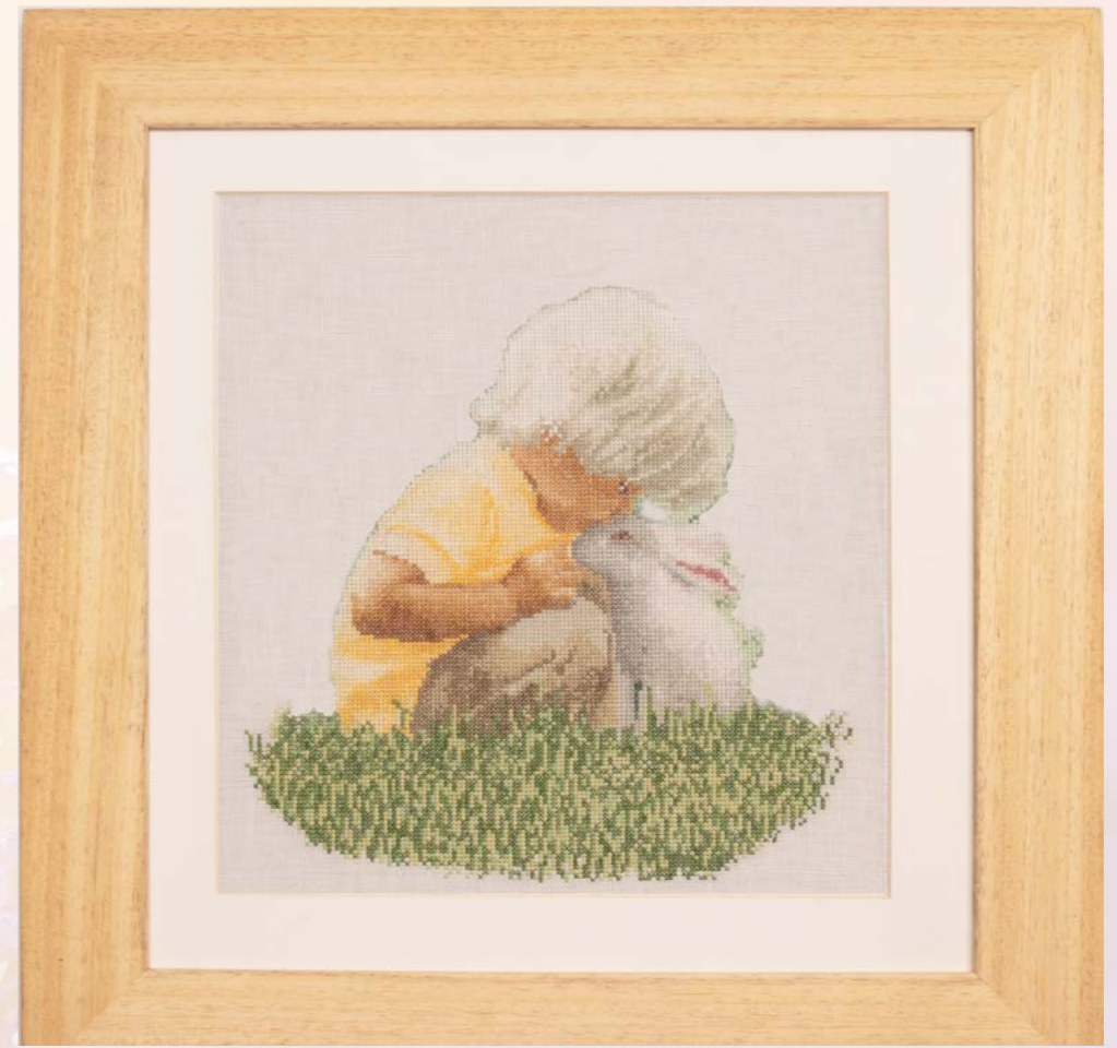
590 24x26CM / 9.5x 10Inch