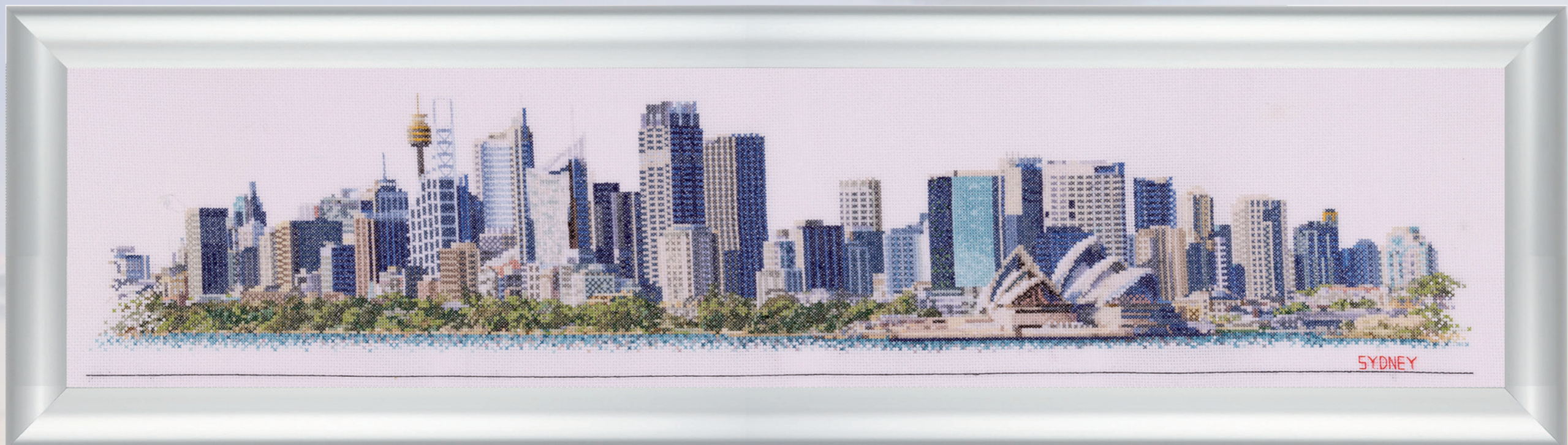
568 Sydney 20x45CM / 8x18 Inch