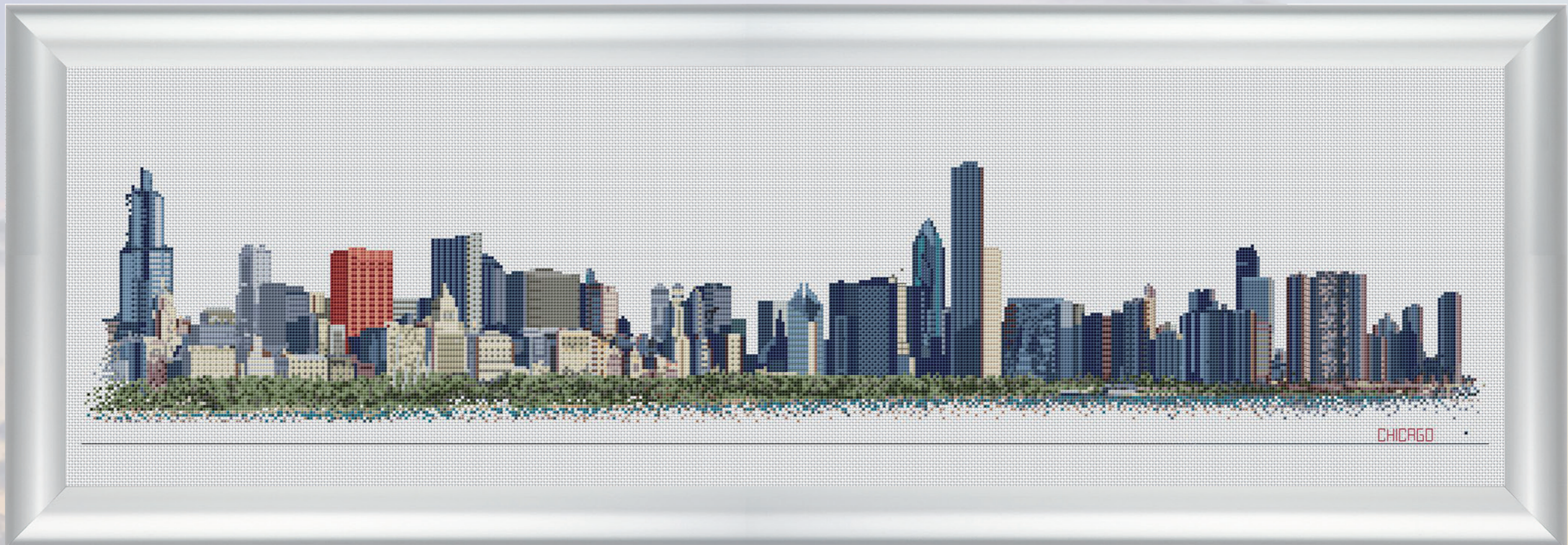
603 Chicago 20x45CM / 8x18 Inch