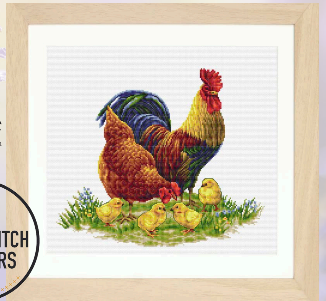
DSB044A 28x28CM / 12x12Inch