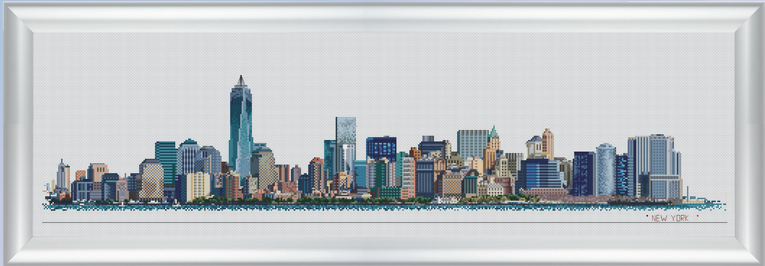
602 New York 20x45CM / 8x18 Inch