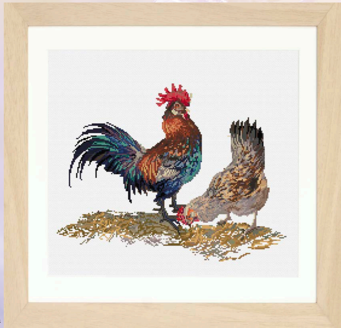
591 30x30CM / 12x12Inch