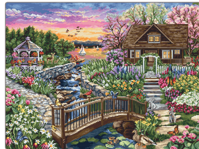
B2379 Spring Blooms on the Lake Colors: 51 Size: 17x12.78 in / 43 x 32.5 cm Threads: Anchor 100% cotton Fabric: Aida 18 ct. "Zweigart"