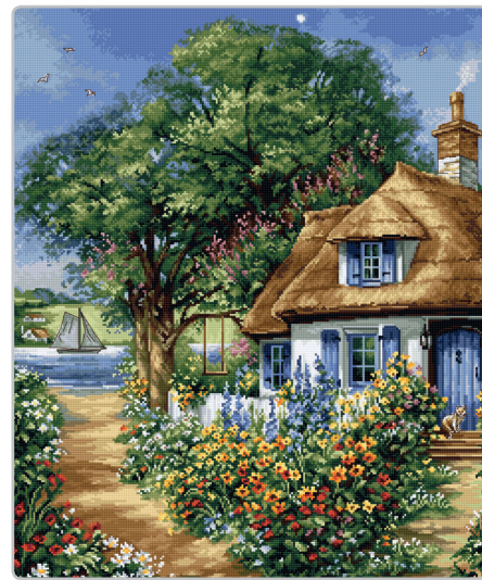
BU5000 Summer landscape Colors: 48 Size: 13.33 x 16.06 inches or 34 x 41cm Threads: Luca-S 100% cotton Fabric: Aida (100) 18 ct. "Zweigart"