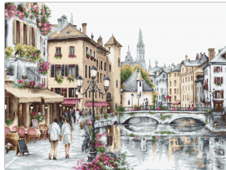
B2384 Lake Annecy Colors: 54 Size: 17.67x13.33 in / 45x34 cm Threads: Anchor Fabric: Zweigart Aida 18 ct. (100/101)